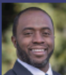
Superintendent of Public Instruction Tony Thurmond