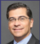
Attorney General (Dual) Xavier Becerra