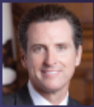
Governor Gavin Newsom

the following State Constitutional Candidates for the 2018 elections