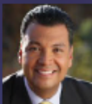
Secretary of State Alex Padilla