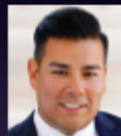
Insurance Commissioner Ricardo Lara